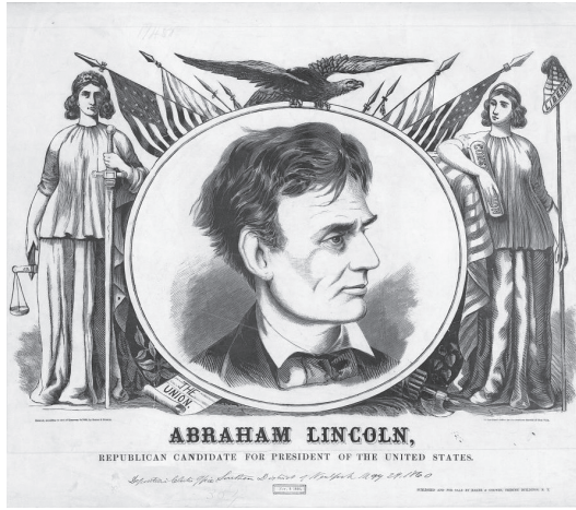
Lincoln presidential poster.

opinions about Lincoln as a man and a candidate were beginning to solidify on both sides of the issues. In May of 1860, his popularity had soared during his famed “rail-splitter” speech, in which Lincoln told a feverish crowd how as a young man he split rails and built fences and homes along the Sangamon River. On cue, two old fence rails were brought down the center aisle through the crowd, draped in red, white, and blue streamers and a large banner. Both rails were made by Lincoln and a cousin on land just west of Decatur, the crowd was told. The place “was electrical,” wrote one observer, and went wild for Lincoln, who, as the banner proclaimed, became The Rail Candidate for President 1860 the next day by winning the Republican nomination in a unanimous vote.